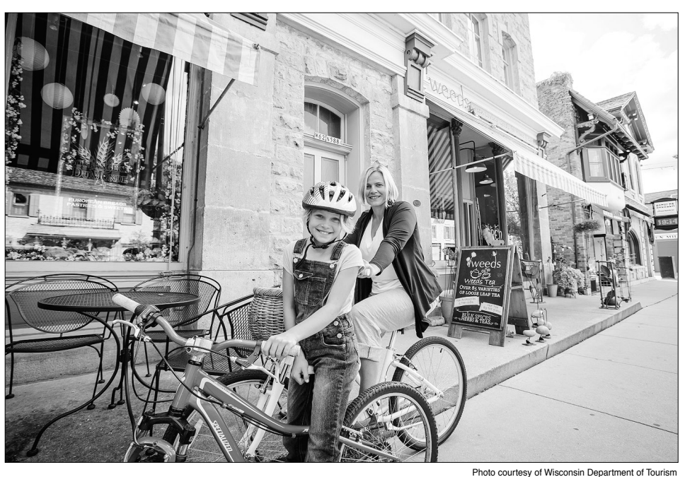
A mother and daughter bike in downtown Cedarburg.

Copyright \diamondsuit 2020 Conley Publishing Group. All Rights Reserved. 03/03/2020 March 3, 2020 9:53 am (GMT +6:00)