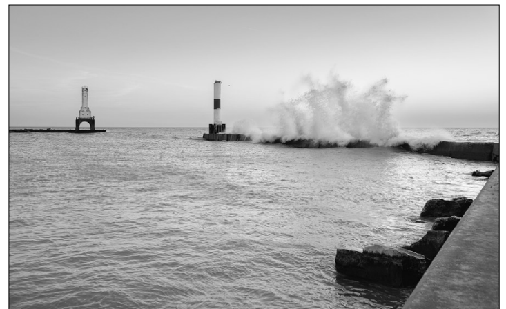
"Lighthouse Sunrise"